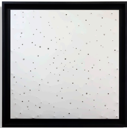
KEISUKE MATSUURA (JAPAN 1970) "JIBA PW 2" 103 X 103 X 6,5 CM - 2017