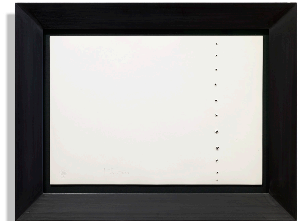
LUCIO FONTANA (AR.1899-IT, 1968) - "CONCETTOSPAZIALE" 35 X 50 CM - 1965 - SIGNED L. BELOW PROVENANCE: STUDIO BIBLIOGRAFICO MARINI MULTIPLE ORIGINALE, LITERATURE HARRY RUHÉ AND CAMILLO RIGO LUCIO FONTANA GRAPHICS, MULTIPLES AND MORE 2006 PAGES 16 AND 17