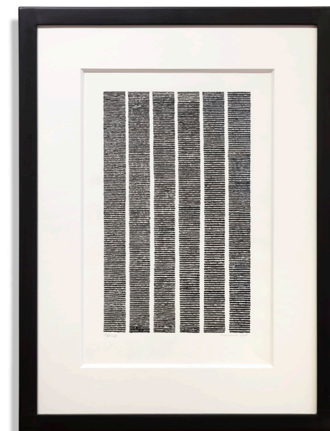
JAN SCHOONHOVEN (NL (NL 1914-1994) O.I. INK ON PAPER 1975