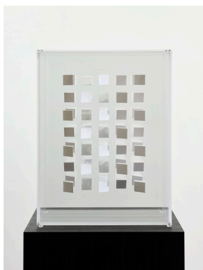
KLAUS STAUDT (D 1932) OBJECT, UNTITLED, 3/5 34 X 26 X 16 CM - 2003 SIGNED AND DATED IN THE BOX