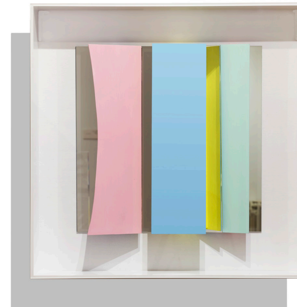
CHRISTIAN MEGERT (BERN 1936) "ID 31" - 71 X 71 X 12 CM - 2015 WOOD, MIRROR, ACRYLIC, PERSPEX SIGNED AND DATED BACK