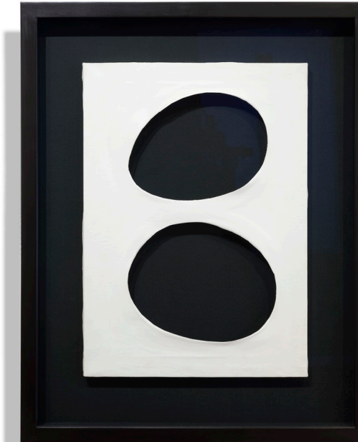
DADAMAINO (IT. 1930-2004) "VOLUME" WATERCOLOR ON CANVAS 50 X 35 CM - 1960 PROVENANCE: PRIVATE COLLECTION ITALY CERTIFICATE: 575/10, 15-12-2010 ARCHIVIO FLAMINIO GUALDONI