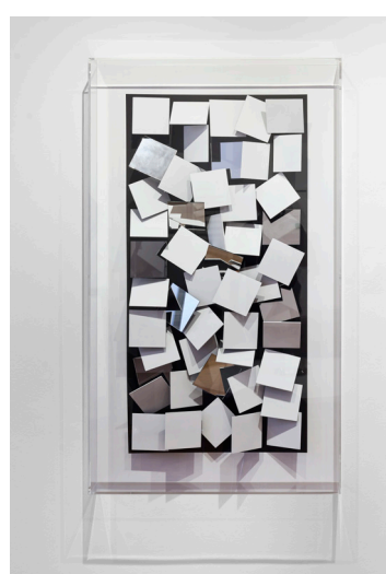
CHRISTIAN MEGERT (BERN 1936) RELIËF "ID 13" - 140 X 80 X 12 CM WOOD, MIRROR, ACRYLIC, PERSPEX 2017