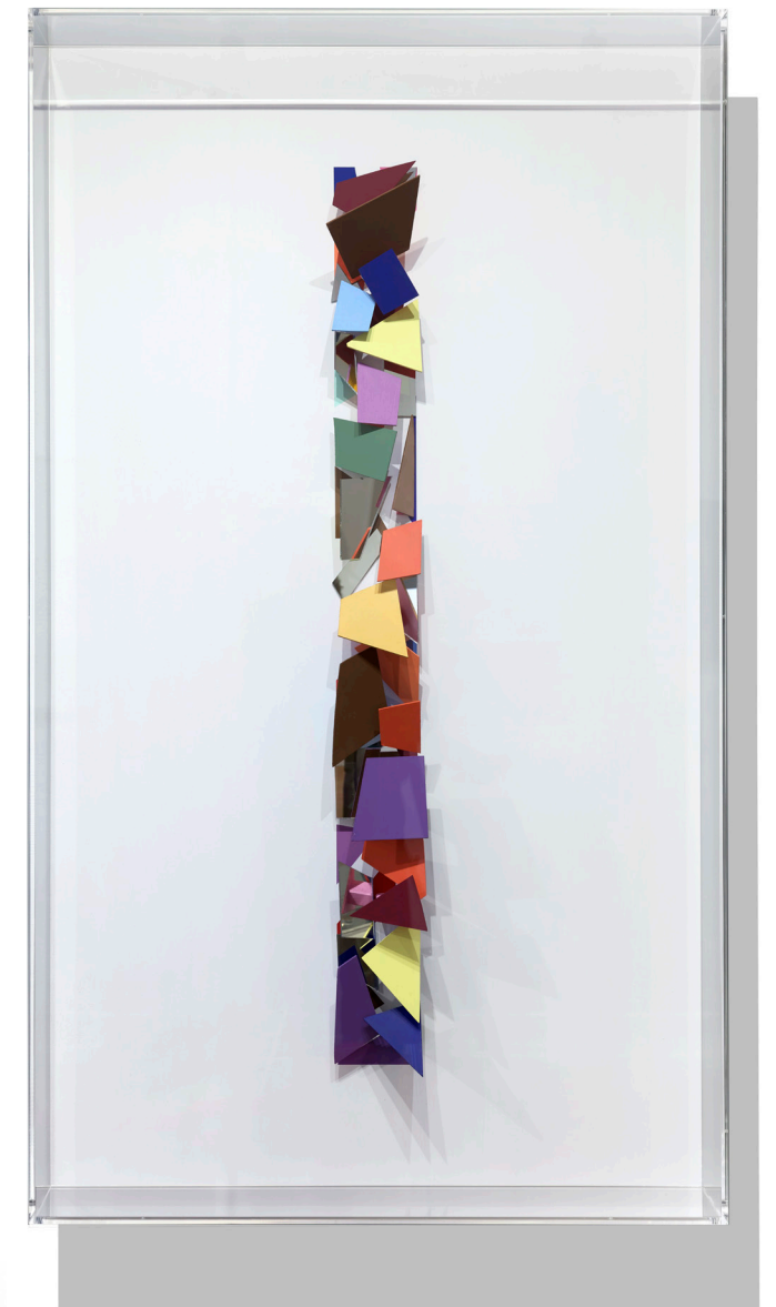
CHRISTIAN MEGERT (BERN 1936) "ID 15" - 140 X 80 X 12 CM - 2017 WOOD, MIRROR, ACRYLIC, PERSPEX SIGNED AND DATED BACK